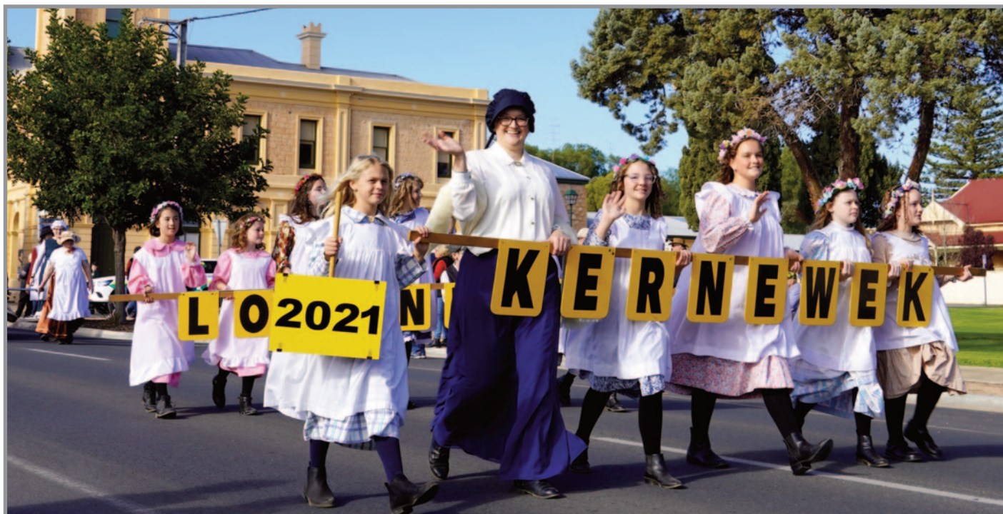
The community were out in full force to celebrate during the Kernewek Lowender Street Parade.

Copper Coast is the Lifestyle Location of Choice . There is much that makes up the fabric of the Copper Coast, helping to make it the great place it is.