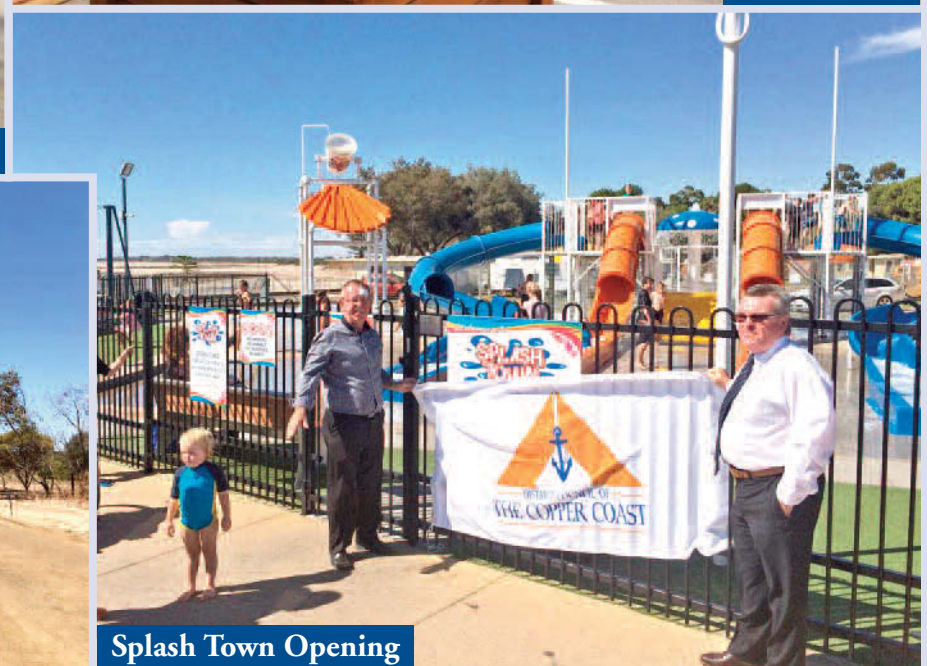
Splash Town Opening