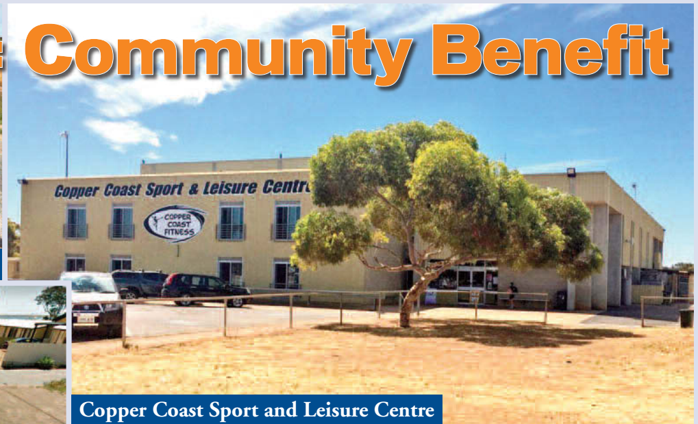
Copper Coast Sport and Leisure Centre