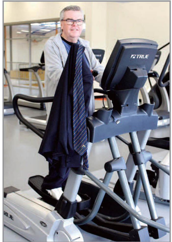
"Suit & Tie jettisoned for a Cardio Rehab workout at the CCSLC"

This will involve the spending of $8.5million of Council's own funds on Capital Works. Previously we did not have the