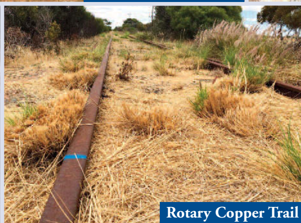
Rotary Copper Trail