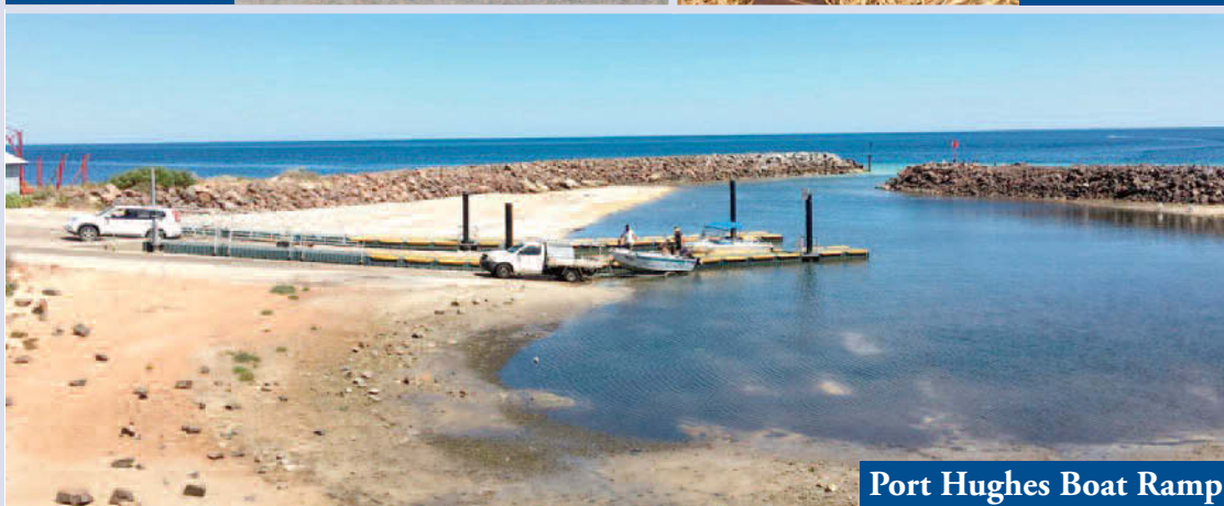
Port Hughes Boat Ramp