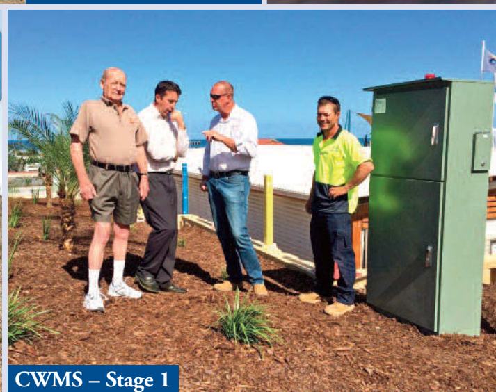
CWMS – Stage 1