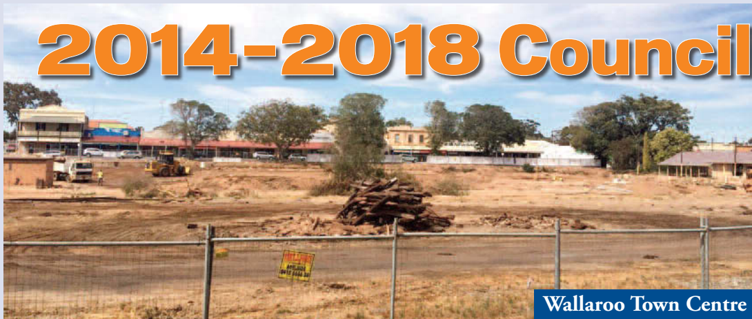
Wallaroo Town Centre