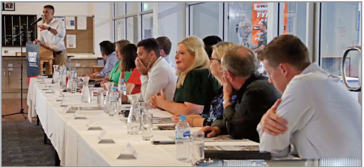
Premier Peter Malinauskas, State Cabinet Ministers and Department Chief Executives visited the Copper Coast to hold Community Roundtables and Forums.

I am debating with myself whether time does fly. It seems like it was only yesterday we were celebrating Christmas, but then again Christmas seems like an eternity ago because we have packed so much into the last few months. My perception changes daily.