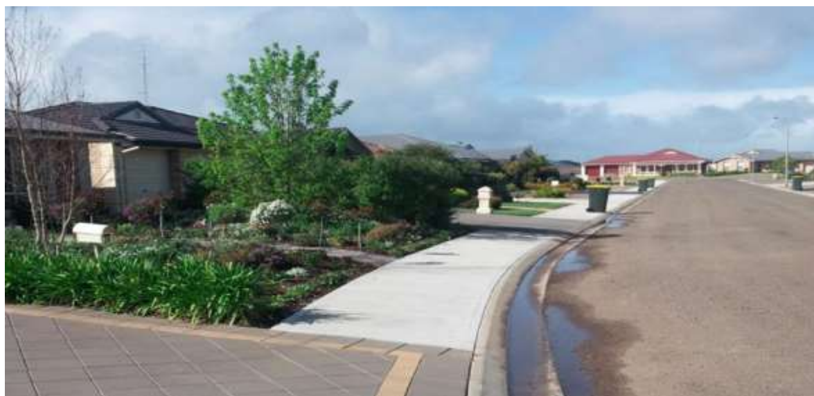
Figure 2 - landscaping to the back of footpath

The resident has spoken to all of the property owners and has the support of a large majority of them, but couldn't secure full support for his proposal to move forward under council staff delegation in accordance with the policy (See attachments). Therefore this proposal must now be decided by the Councillors at a Council meeting. They will receive a summary of all submissions and have to make a decision in the best interest of the majority of ratepayers.