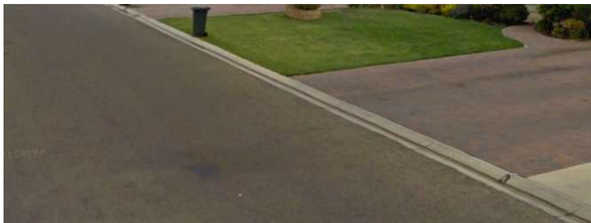
Figure 1 - landscaping to back of kerbing

Residents would then be able to develop the road verges in accordance with Council's Verge/Footpath Development by Residents Policy. This Policy allows residents to extend their landscaping to the edge of the kerbing and footpath. As show in figure 1 and 2 below.