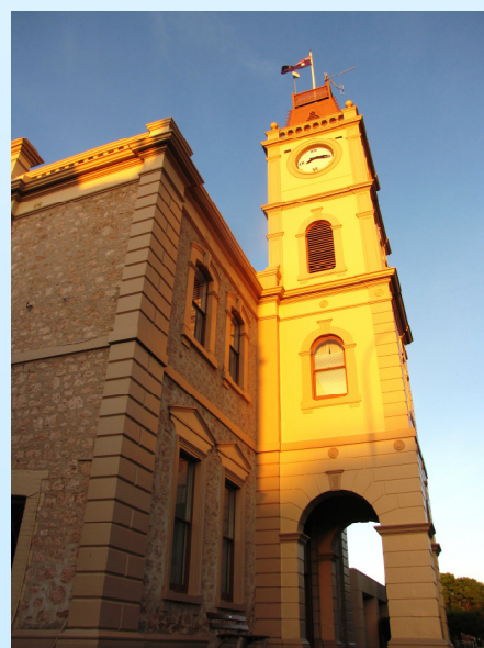
Kadina Town Hall Taylor Street, Kadina