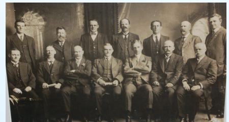
Kadina Town Council 1916-17

The close of voting is 5pm Friday 12 th November 2010 – so if you want your voice heard make sure your completed ballot paper is sent back as early as possible.