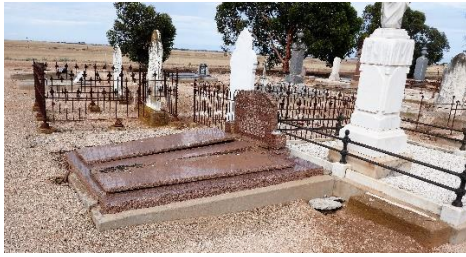
Reactive soils/inadequate foundations