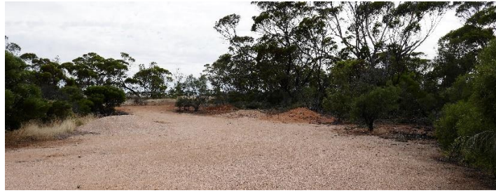
Crushed rock and soil heaps at the rear of the interment area