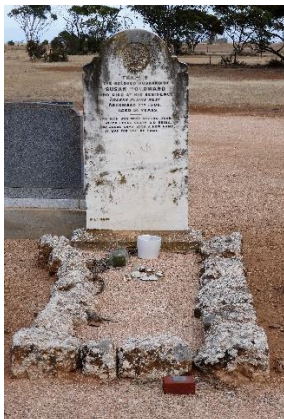
Francis Woodward 1886

The site is not site heritage listed. It contains a variety of monuments in varying states of 'ageing'. Whilst the soils at Green Plains are predominantly clay, sand and limestone, they appear to be more reactive than those at other CCC cemeteries. Consequently where monuments have minimal foundations, movement is likely to occur.