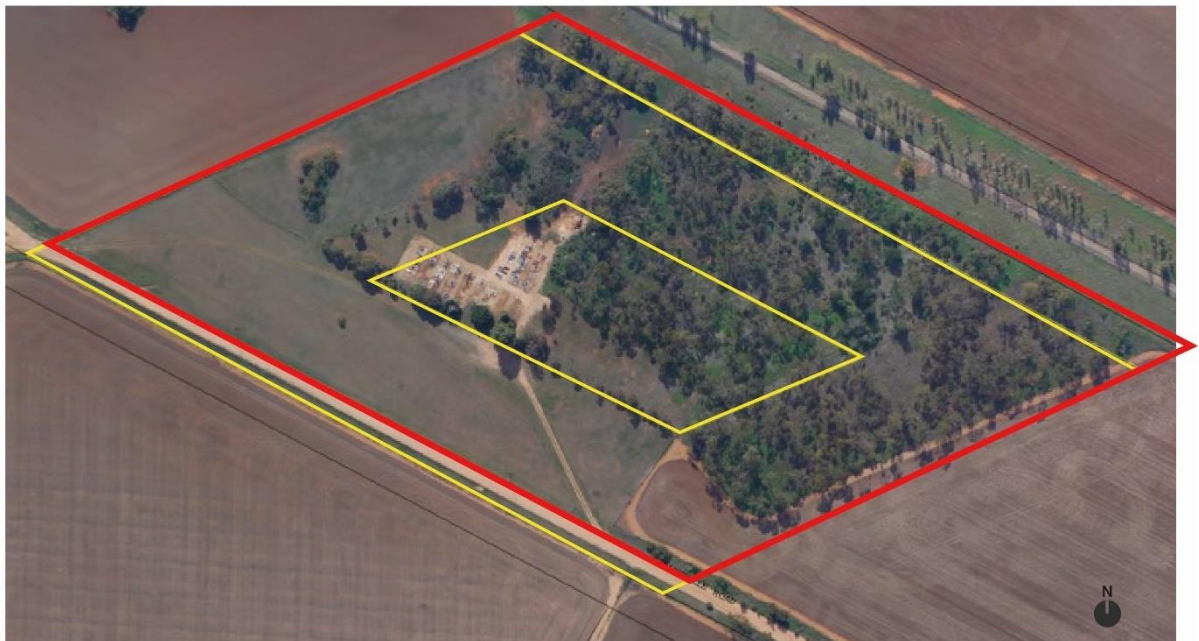
Image supplied by CCC, enhanced by Florence Jaquet Landscape Architects

The scope for cemetery activity is red lined. Some title boundaries are yellow.