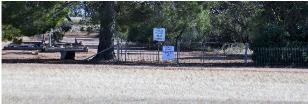
Grassed space, used for parking, between Paskeville Rd and the cemetery entrance.

Whilst there is only a small cemetery name sign adjacent to the entrance gate, the visible monumentation enables passers-by to identify the site from the road. As the front fence is mainly low level prefabricated wire mesh, supported by star pickets, it does not impede visibility.