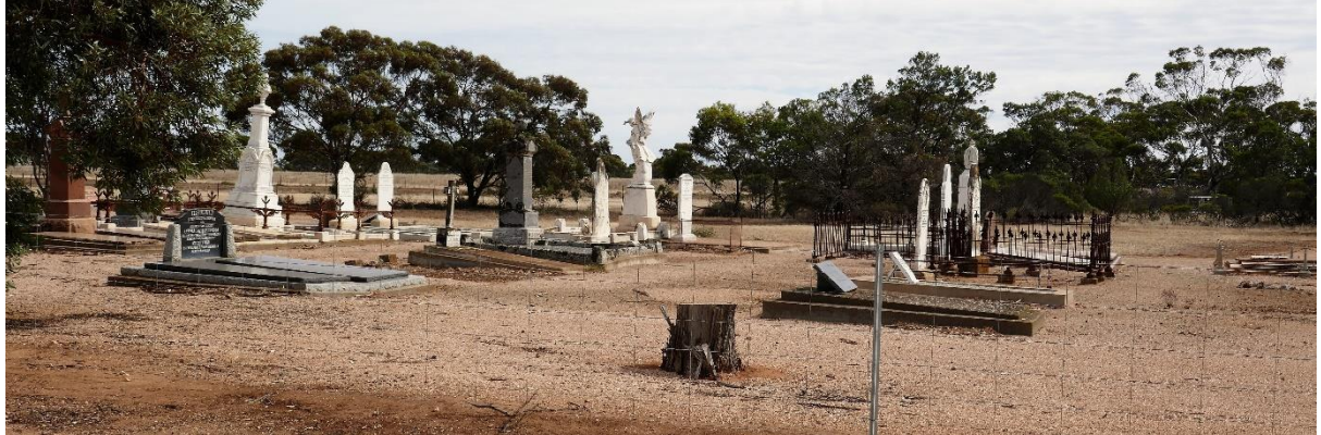
Tree stumps need removal

Spoil from grave excavation is stored discretely towards the back of the area. To enhance visual amenity and diminish risk, tree stumps should be removed. Trees and shrubs should not be allowed to be planted within or on top of interment spaces, without written authorisation of CCC. Unauthorised plantings should be removed. Where trees or their roots are impacting or are likely to impact memorials, they should either be removed or root barriers installed.