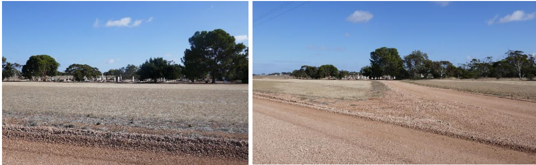
View of the site from Paskeville Rd. Access and egress from site via an unsealed road.

VALUER GENERAL - 3410179596 - ASSESSMENT A2086