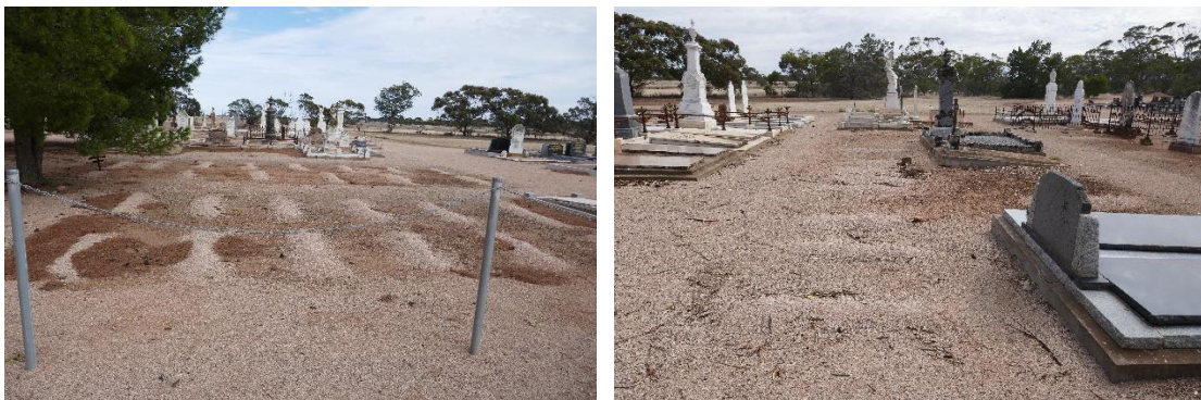
Unmarked graves, delineated with crushed rock mounds

Given the inconsistencies in historic records and the potential number of unmarked graves, it is not practical to expect CCC to mark and memorialise every unmarked grave.