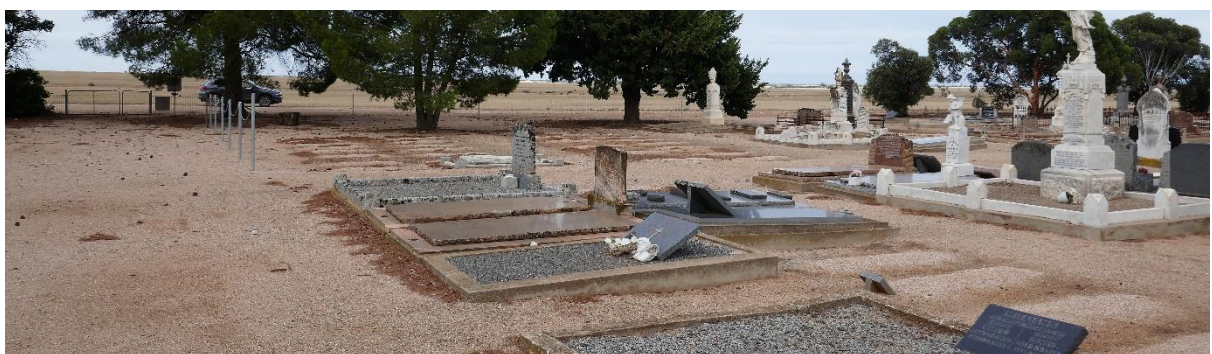
Entrance gate viewed from within the site

The interment areas are laid out in a grid pattern, with monumental graves predominantly in dual rows i.e. head to head, in a regular pattern. Whilst the memorialisation indicates religious differentiation within the grids, regrettably there are no markers or displayed site maps to assist visitors with plot identification.