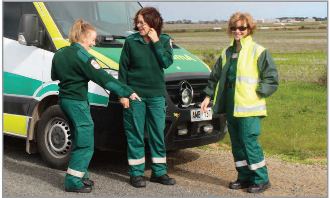
SA Ambulance Officers discuss the newly sealed road which has enhanced the patients comfort and eased transportation to the Airport especially in emergency situations.

various ways, and while there is a formal submission period and process; Elected Members as they interact with our Community throughout the year also become aware of the concerns and aspirations expressed by residents, ratepayers and visitors. While all submissions and ideas may not be achievable or feasible within a particular Annual Business Plan is not to say that they are dismissed and forgotten. In previous years we have received many submissions and heard robust presentations at our public forum, where this year it was somewhat disappointing that the responses were lower and little interest expressed during the public forum process.