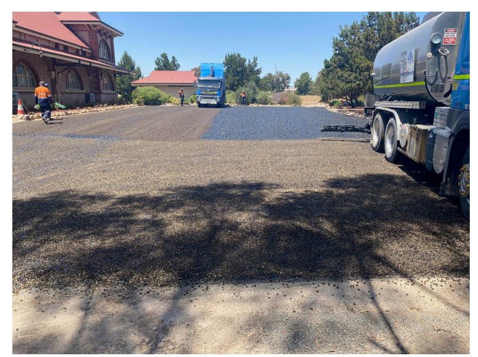
Visitor Information Centre, Moonta