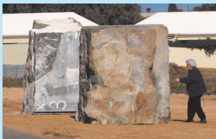
Community Representative Cathleen Field on site

The three larger blocks represent the three large towns of the Copper Coast with smaller ones representing smaller towns and settlements. Drill holes on the sides of the blocks emulate the wooden wall supports within the copper mines, with the copper headframe being representative of mining and smelting structures.