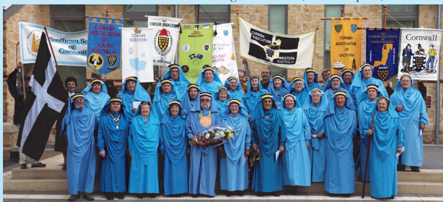
Gathering of the Bards, Davies Square, Wallaroo