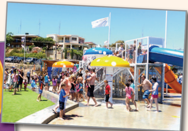
◆ MOONTA BAY WATER PLAY – This facility will generally be open between noon and 4pm in school holidays and weekends between December and March. Other times and long weekends will be weather dependant. However, Council will undertake a review of the facility in 2015 to ensure the operation times and maintaining it as a free facility is the best way to manage the facility for the longer term.