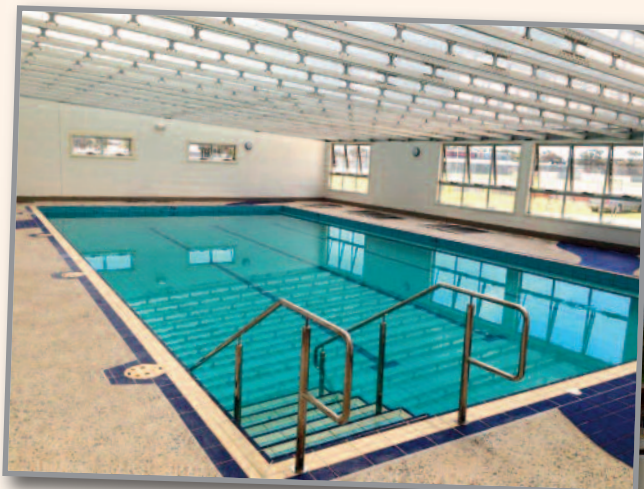
◆ PROGRAM POOL – Contact CCSLC for all bookings and enquiries on 8821 3106.