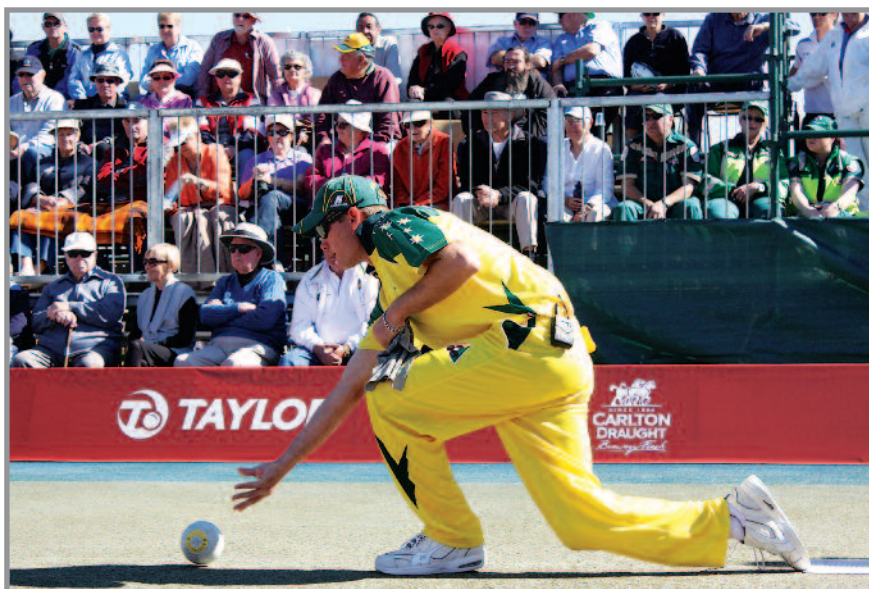
Australia v South Africa Bowls Test at Moonta.

The Council actively works with the community to provide infrastructure and facilities that are attractive to event managers