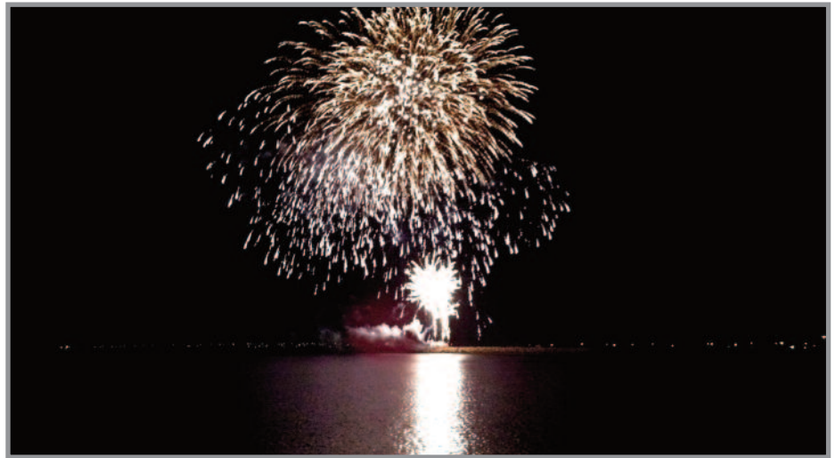
Wallaroo Bay was the scene for spectacular fireworks as the clock struck midnight.

We are fortunate that each four years we are provided the privilege to vote and elect leaders for our community. We are afforded freedom of speech, but with that freedom of speech,