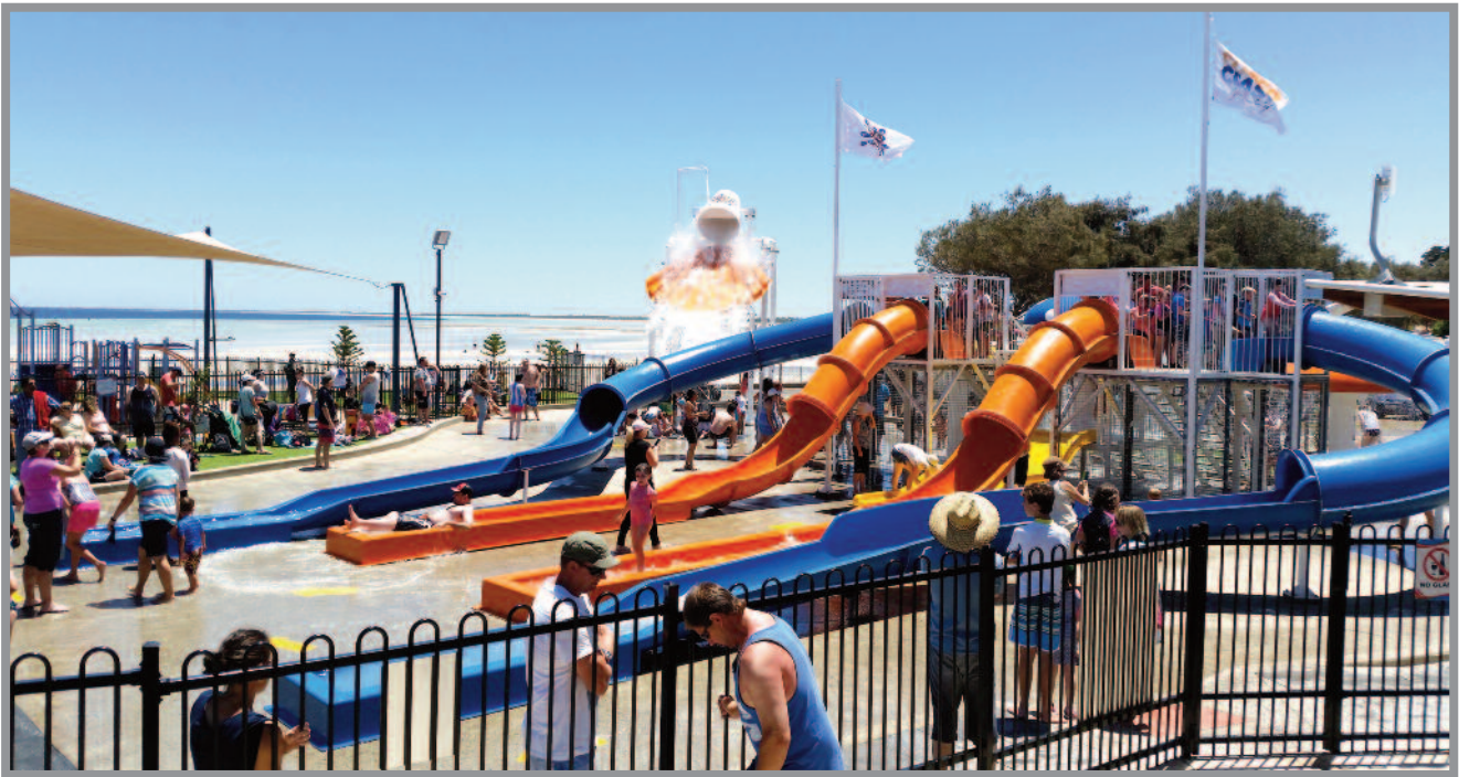
Residents and visitors enjoying Council's new facility "Splash Town" at Moonta Bay.