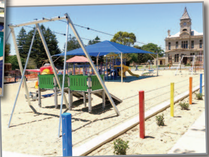
◆ WALLAROO PLAYGROUND – a flying fox, one of the new additions as part of the playground upgrade.