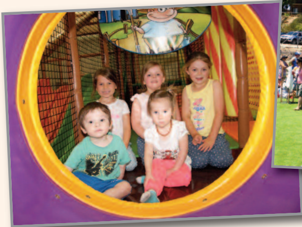
◆ INDOOR PLAY CENTRE – Contact Copper Coast Visitor Information Centre for details on 8821 2333.

The Council has had a number of projects successfully completed in 2014. We are very thankful for the Grants received to undertake these important projects in our community and the hard work by staff to complete the required paperwork to seek this additional funding for our community.