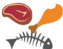
meat & bones