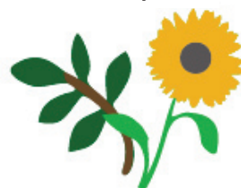
prunings & weeds