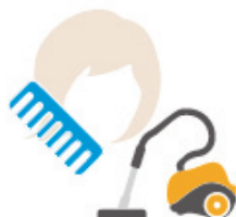
hair & dust