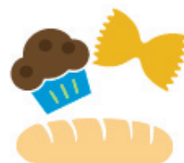
bread & pasta