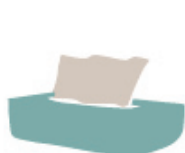
serviettes & tissues