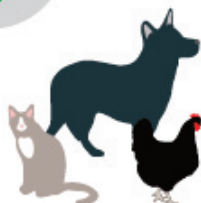
pet waste & fur