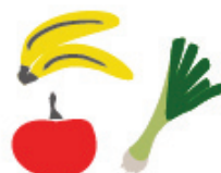
fruit & veggies