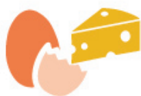
eggs & dairy