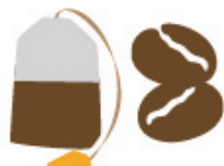
tea & coffee